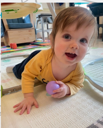
CARSON MAY 16TH